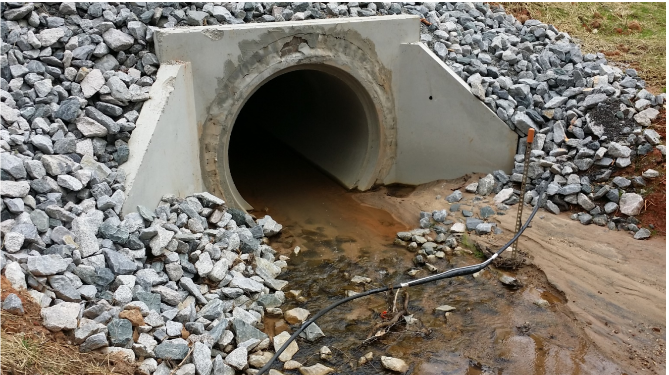
Photo 2: Rock was added to the shoulder of the road and around the new pipe and headwall.