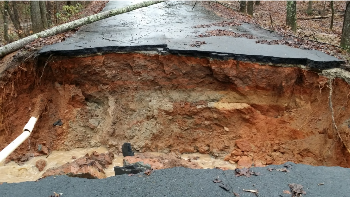
Photo 1: Approximately 60 homes within the Chanticleer Subdivision were without water and had no access to and from their homes when a 72-inch diameter metal pipe failed, collapsing the road.