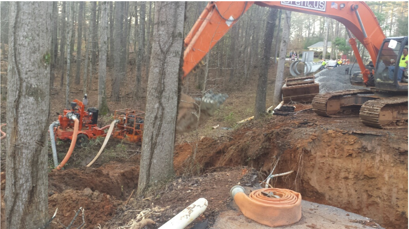
Photo 2: Site excavation, clean up and water pumping underway to prepare for new pipe placement.