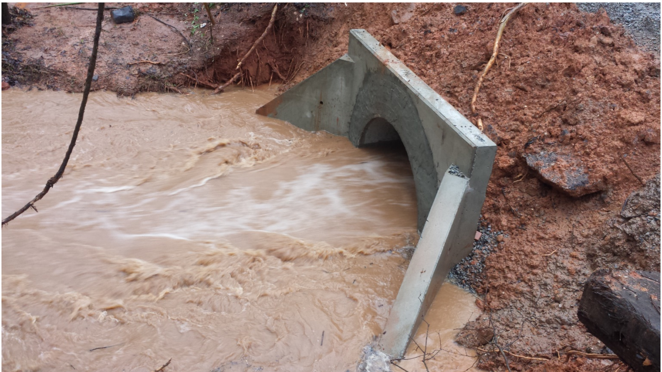
Photo 2: Photo shows water flowing through the new concrete pipe. Pipe replacement and new headwall installation was successful.