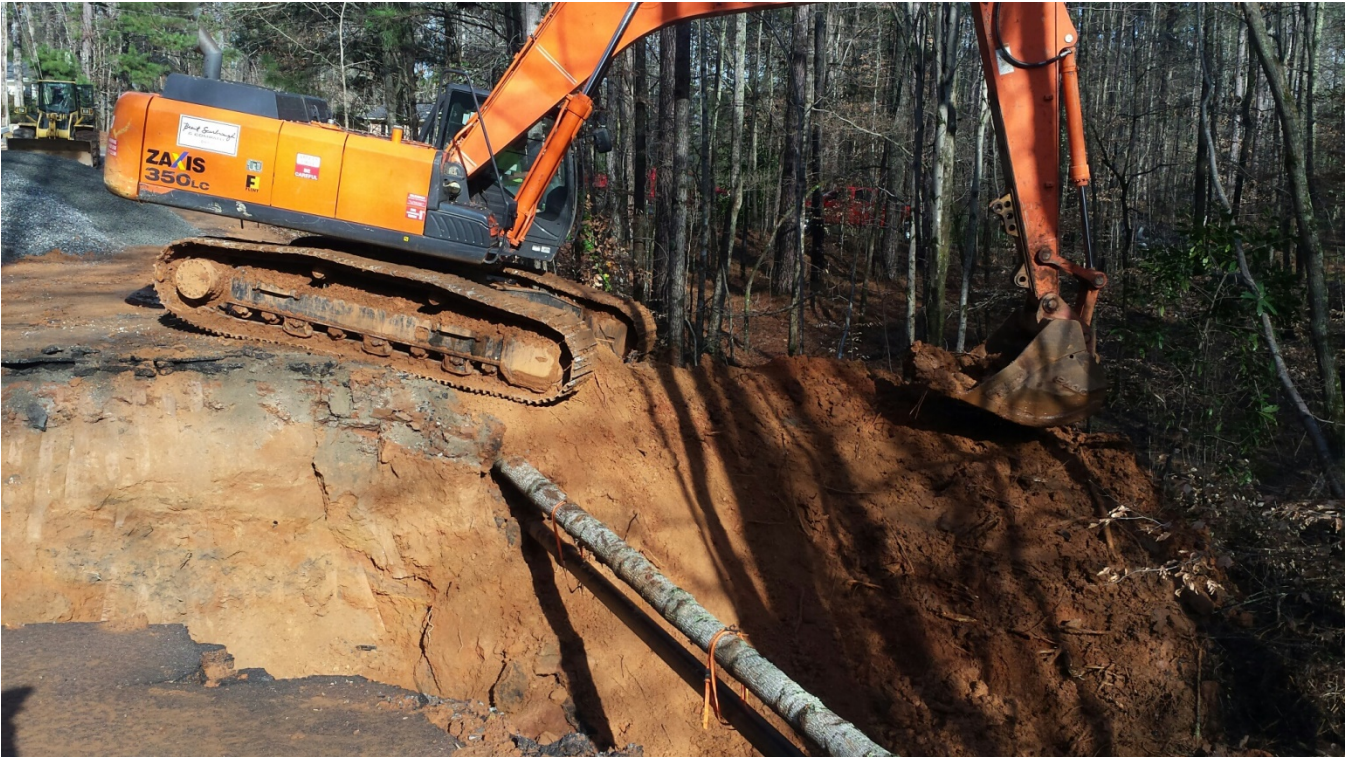
Photo 1: Site excavation and clean up underway to prepare for new pipe placement.