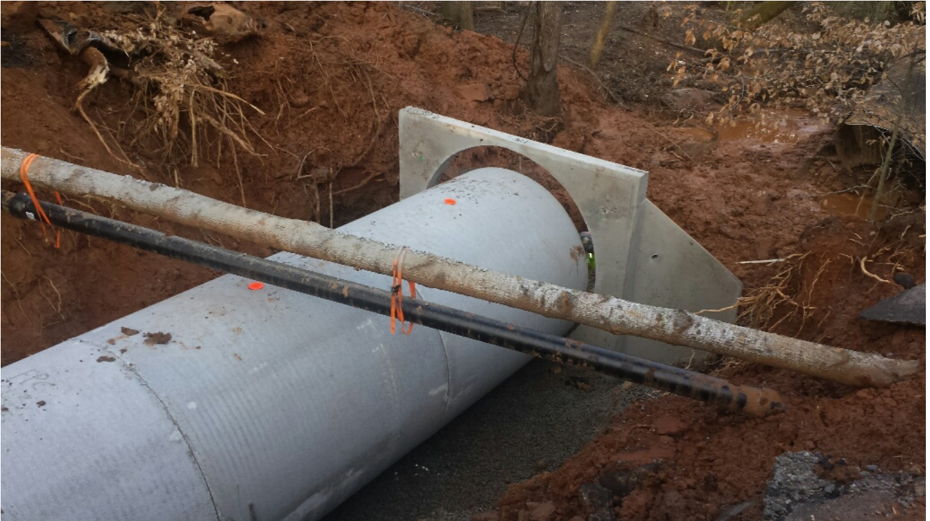
Photo 1: New 72" concrete pipe is being installed. Exposed utility lines are visible in the photo.