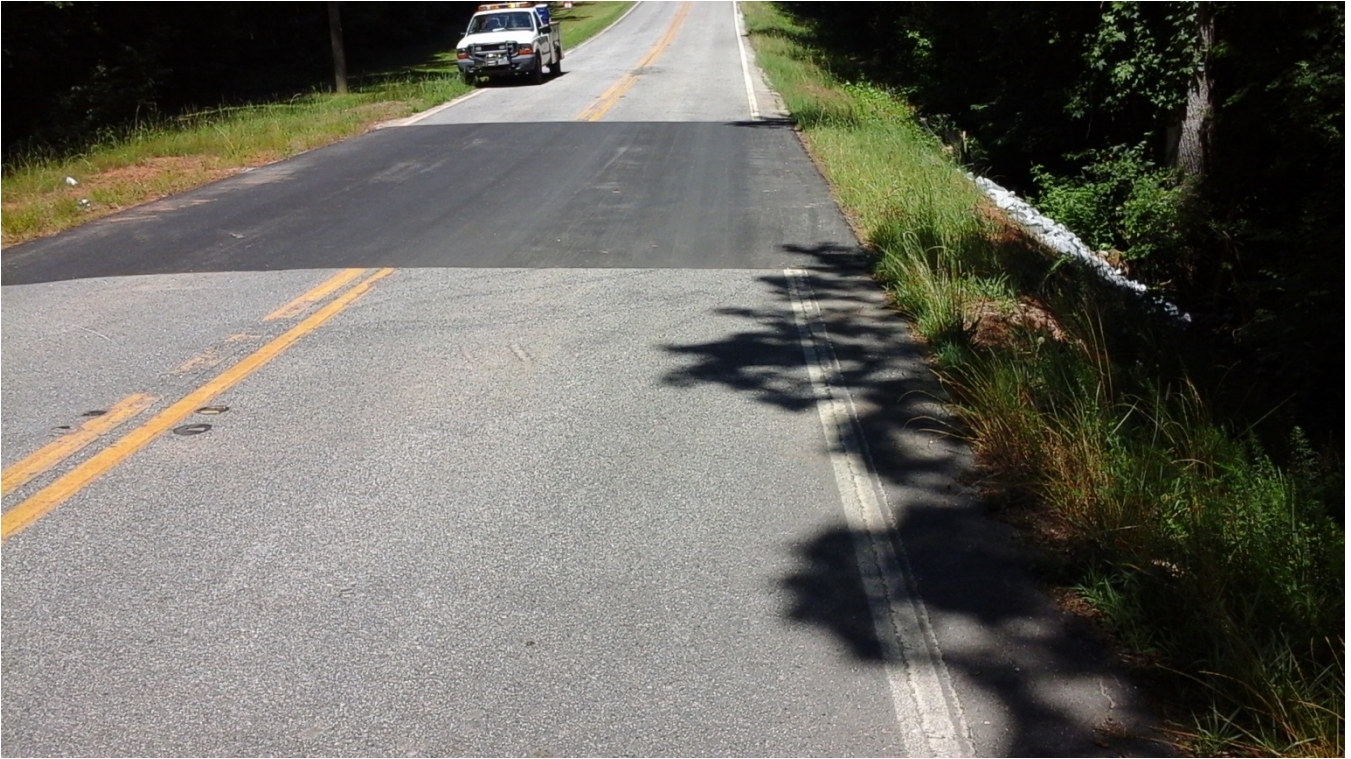
Photo 1: The large collapsed hole in Canterbury Lane was repaired and paved.