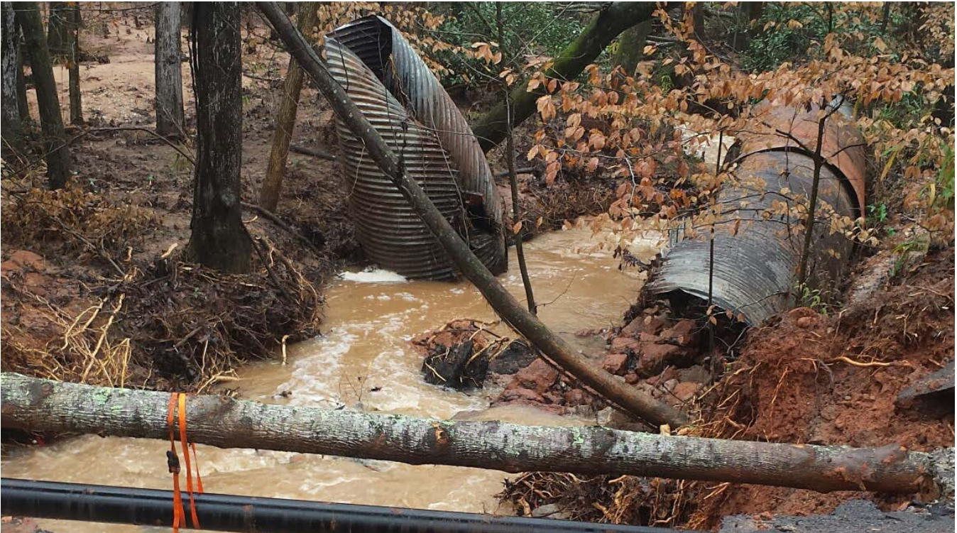
Photo 2: The metal pipes failed, washed out from under the road, and were found downstream from Canterbury Lane