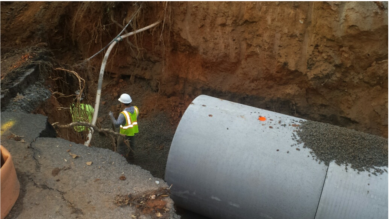
Photo 2: New 72" concrete pipe is being installed. Exposed utility lines are visible in the photo.